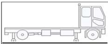
Type 1 - Self Powered Rail Wheels

Road rail vehicles can be classified into 3 main types, depending on their braking and traction arrangement, as follows: