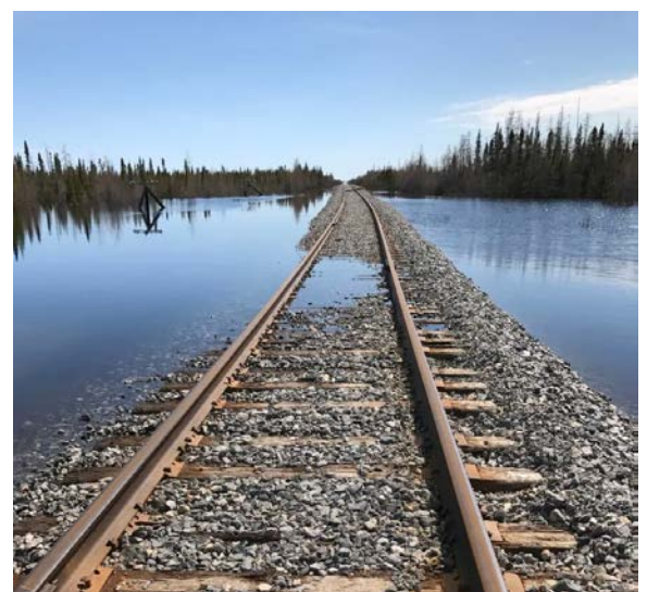
Figure 3 Hudson Bay Railway impassable after flooding 5

Although small changes in rail technology and the movement towards electric rolling stock, the industry still has a long way to proactively reduce the carbon footprint of transportation by incorporating sustainability into Business As Usual (BAU).