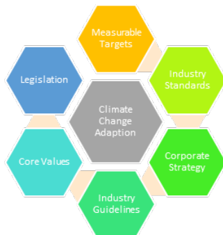
Figure 2 Pillars for incorporating climate change into BAU 4

The impact that Climate Change has on rail assets is extensive; hotter and drier summers leads to pavement deterioration, rail buckling and increased need for passenger thermal comfort through the use of HVAC systems. Warmer, wetter winters leads to surface water, increased frequency of landslip, scour and washout. Extreme precipitation is putting a strain on drainage systems and extreme winds are damaging overhead wiring systems.