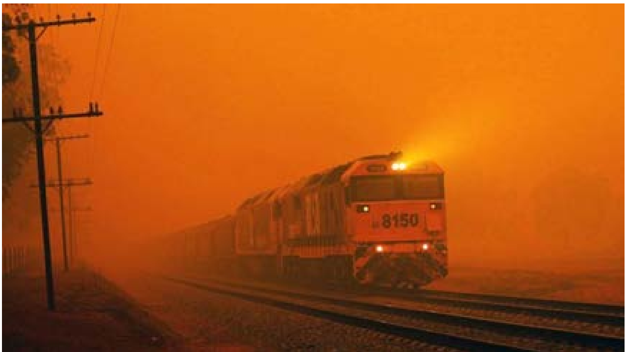
Figure 1 – High temperatures resulting in speed restriction on the NSW rail network 1

Climate Change has had an increasing spotlight in the media over the years with overwhelming scientific evidence and disastrous weather events such as the recent wildfires across the New South Wales East Coast reinforcing the detrimental effects our carbon footprint has on our planet. Climate Change is something that cannot be ignored, and the rail industry needs to actively adapt to cope with the adverse effects extreme weather has on railway networks across Australia.